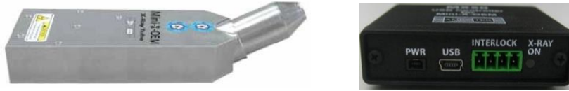
Mini-X2 Components: Mini-X2 X-ray Tube Module (left) and Mini-X2 Controller (right)

Amptek is replacing the Mini-X family miniature X-ray tube system with the greatly enhanced Mini-X2 line. The Mini-X2 will consist of two components, the Mini-X2 X-ray Tube Module and the Mini-X2 Controller .