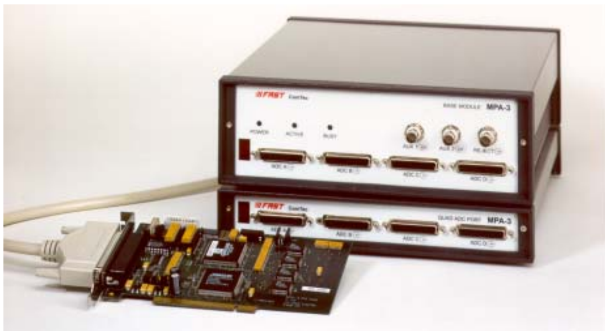
MPA-3 Rev2 15032004 Specifications are subject to change without prior notice