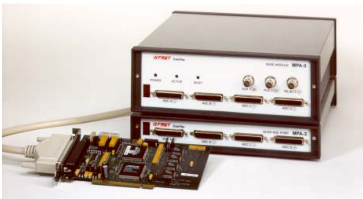
MPA-3 Rev2 15032004 Specifications are subject to change without prior notice